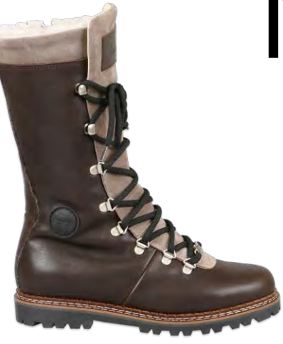
BROWN LEATHER & GREY SUEDE