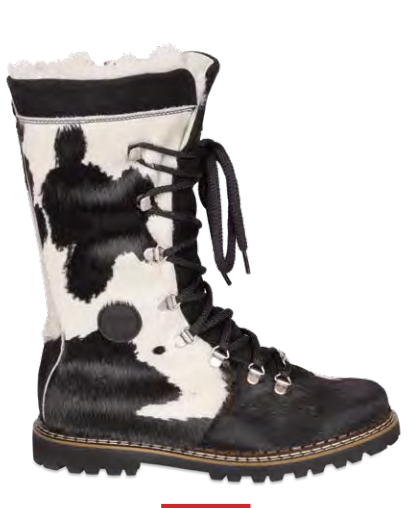
BLACK & WHITE COWHIDE & BLACK SUEDE