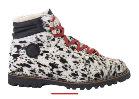
LENA BLACK AND WHITE COWHIDE