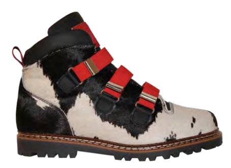
BLACK & WHITE COWHIDE & RED STRAPS