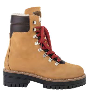
NUBUCK SABBIA & BROWN LEATHER