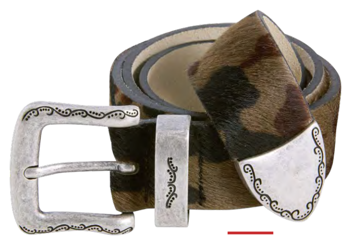
CAMO COWHIDE & BUCKLE 4349