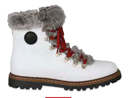
WHITE LEATHER & GREY RABBITFUR