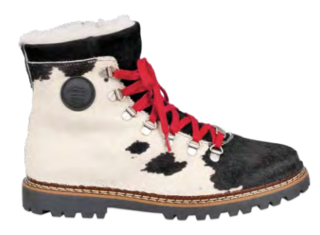
BLACK & WHITE COWHIDE & BLACK SUEDE