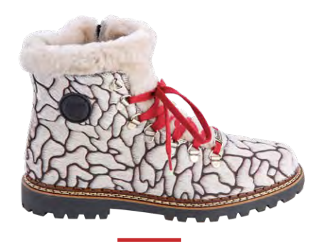
PUZZLE COWHIDE & NATURAL LAMBSFUR