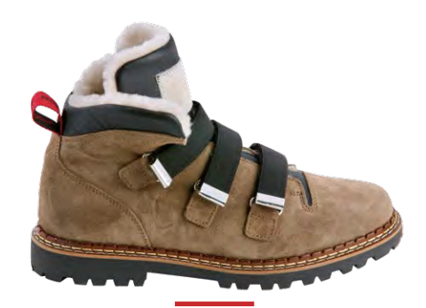
COLORADO SUEDE, BLACK LEATHER TONGUE & BLACK STRAPS