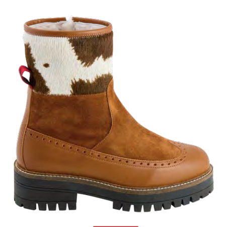
COGNAC SUEDE, COGNAC LEATHER & COWHIDE