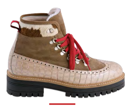
TRUFFLE SUEDE, GREY CROC LEATHER & COWHIDE