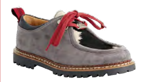
GREY SUEDE, BLACK & WHITE COWHIDE