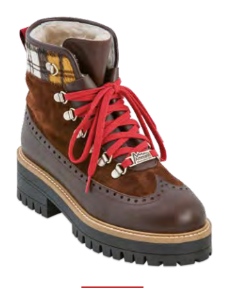
BROWN SUEDE, BROWN LEATHER & TARTAN WOOL