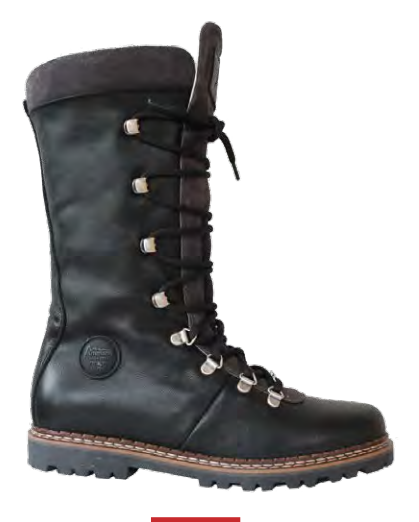
BLACK LEATHER & DARK GREY SUEDE