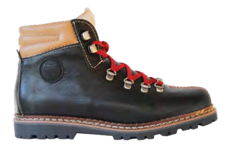
BLACK LEATHER, BROWN & WHITE COWHIDE TONGUE