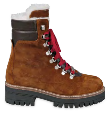
COGNAC SUEDE & BROWN LEATHER