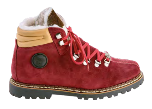
BORDEAU SUEDE, BROWN & WHITE COWHIDE TONGUE