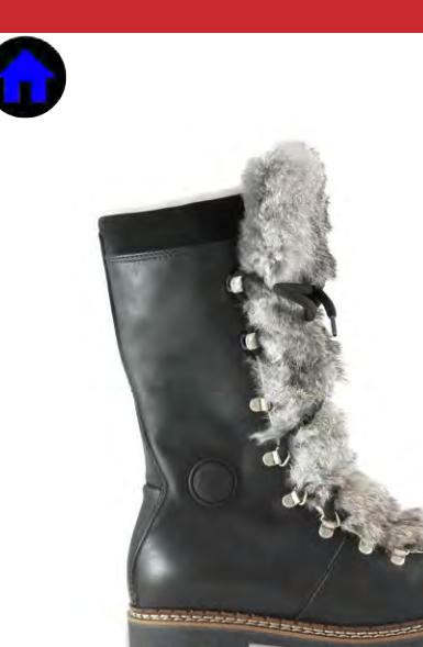
BLACK LEATHER & GREY RABBITFUR