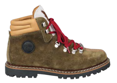
TUFFLE SUEDE, BROWN & WHITE COWHIDE TONGUE