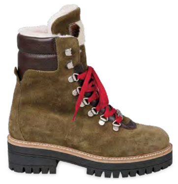
TRUFFLE SUEDE & BROWN LEATHER