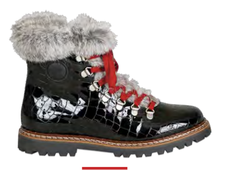
BLACK CROC LEATHER & GREY RABBITFUR