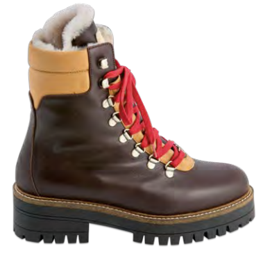
BROWN LEATHER & NATURAL LEATHER