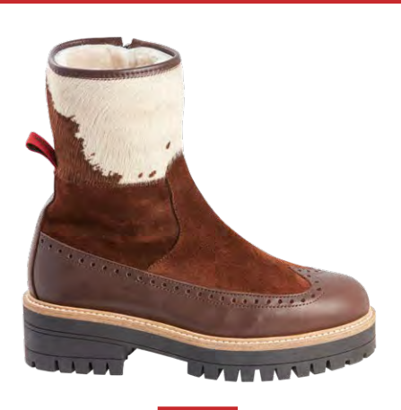
BROWN SUEDE, BROWN LEATHER & COWHIDE