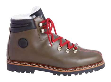
OLIVE GREEN LEATHER & BLACK LEATHER TONGUE