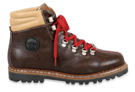
BROWN LEATHER, BROWN & WHITE COWHIDE TONGUE