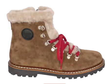
COLORADO SUEDE & NATURAL LAMBSFUR