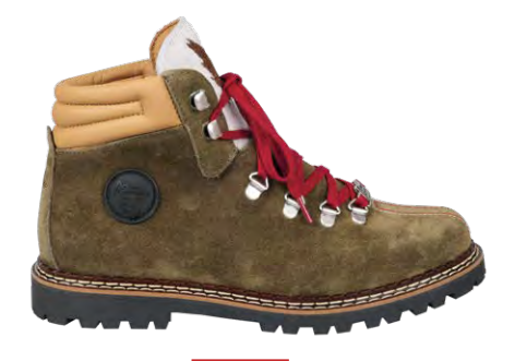
TRUFFLE SUEDE, BROWN & WHITE COWHIDE TONGUE