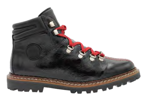
BLACK PATENT LEATHER & BLACK LEATHER