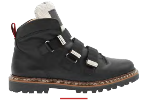
BLACK LEATHER, BLACK & WHITE COWHIDE TONGUE & BLACK STRAPS

BLACK LEATHER, BLACK & WHITE COWHIDE TONGUE & RED STRAPS