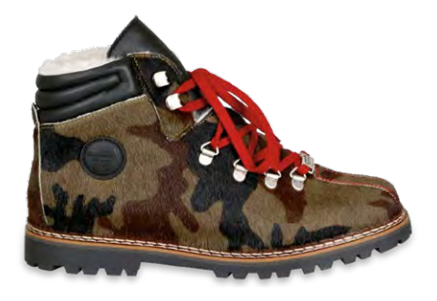
CAMO COWHIDE & BLACK LEATHER TONGUE