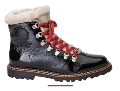
NAPLACK BLACK & NATURAL LAMBSFUR