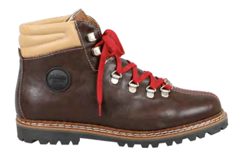
BROWN LEATHER, BROWN & WHITE COWHIDE TONGUE