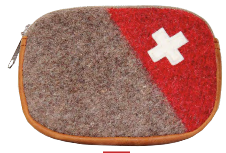
WD 62 - 5.5 x 4 x 1.25 in.

WD 51 - Small - 5.5 x 3.5 x .5 in. WD 52 - Medium - 7.5 x 5 x 2.5 in. WD 53 - Large - 9 x 6 x 3 in.