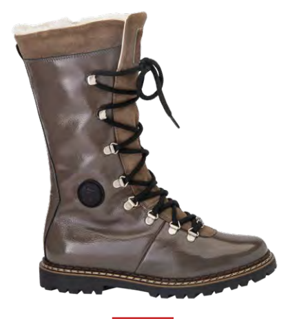
NAPLACK DOVE & GREY SUEDE