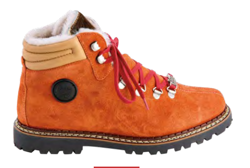
ORANGE SUEDE, BROWN & WHITE COWHIDE TONGUE