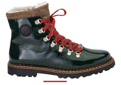
NAPLACK BOSCO & COLORADO SUEDE