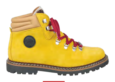
SOLEIL SUEDE, BROWN & WHITE COWHIDE TONGUE