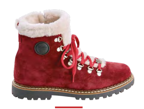
BORDEAUX SUEDE & NATURAL LAMBSFUR