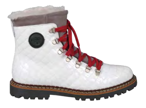
WHITE CROC LEATHER & GREY SUEDE