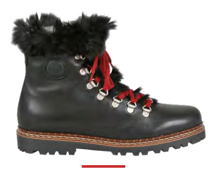
BLACK LEATHER & BLACK RABBITFUR