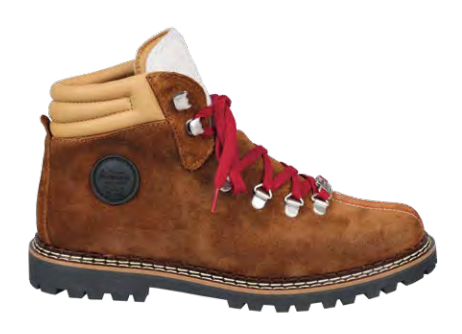
COGNAC SUEDE, BROWN & WHITE COWHIDE TONGUE