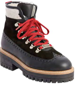
BLACK SUEDE, BLACK LEATHER & COWHIDE