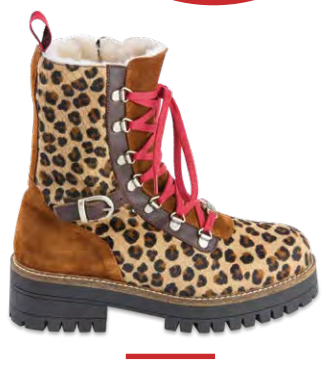
LEOPARD COWHIDE & COGNAC SUEDE