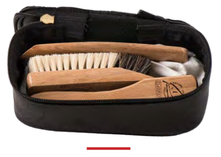
5-6 F - 7.5 x 3 x 4 in.