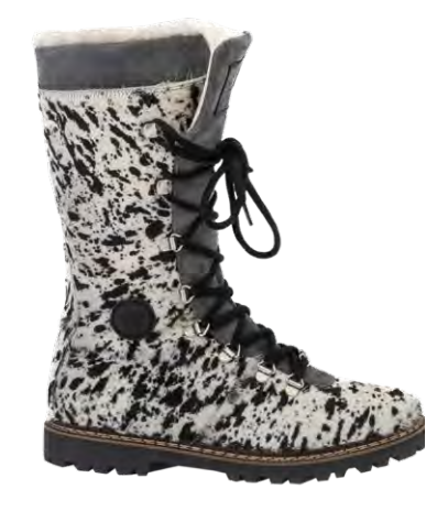
LENA BLACK & WHITE COWHIDE & DARK GREY SUEDE