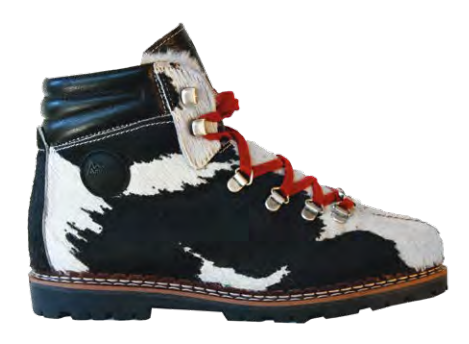
BLACK & WHITE COWHIDE & BLACK LEATHER TONGUE