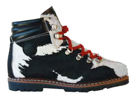
BLACK & WHITE COWHIDE, BLACK LEATHER