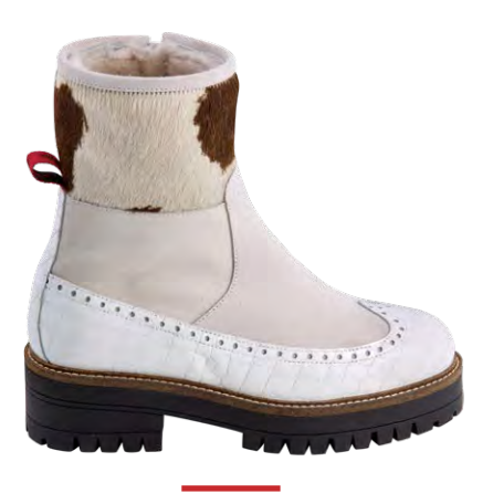
WHITE SUEDE, WHITE CROC LEATHER & COWHIDE