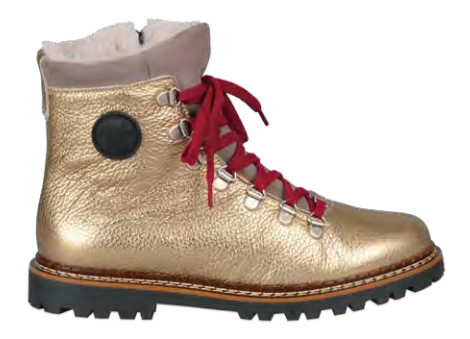
GOLD SHIMMER LEATHER & TAUPE SUEDE