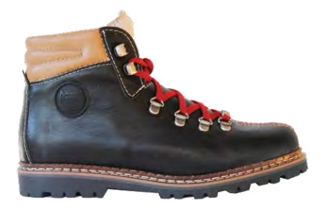
BLACK LEATHER, BROWN & WHITE COWHIDE TONGUE