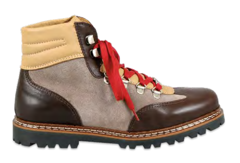
GREY SUEDE, BROWN LEATHER & NATURAL LEATHER